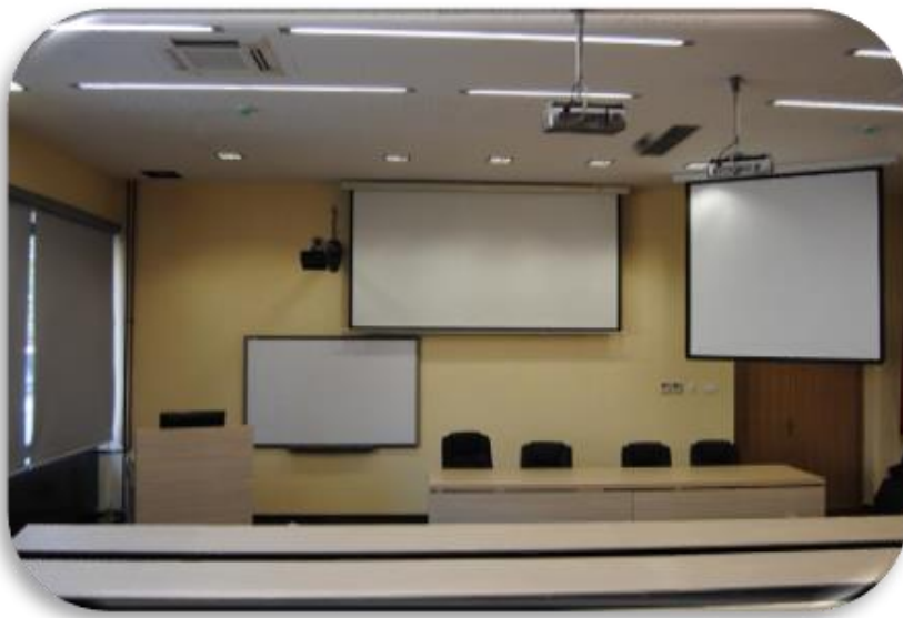
The amphitheatre of the Faculty of Medicine

Basic education is a compulsory type of education and is common to all students.