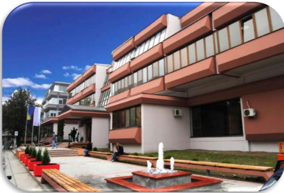
The Faculty of Medicine - central building -

The Faculty of Medicine perfects and develops the methods of scientific research, organises systemic monitoring of professional and scientific achievements and prepares the staff for independent work in their respective professions and scientific research. The Faculty organises and provides continuing professional development for healthcare staff to keep abreast of modern developments in the field and in particular it is engaged in raising and professional development of young scientists and teachers, in line with the Higher Education Reform. It also takes part in research projects in all medical disciplines. It participates in the project of reforming faculties of medicine in BH in line with the Bologna Declaration and the European Higher Education Reform.